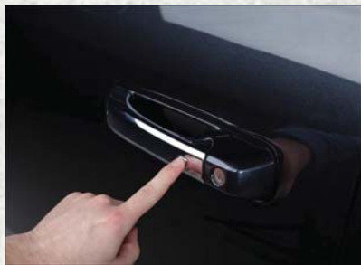
Push The Button To Lock

Do NOT grab the door handle, when pushing the door handle lock button. This could unlock the door(s).