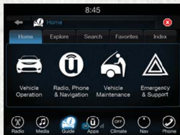
Vehicle User Guide Home Screen