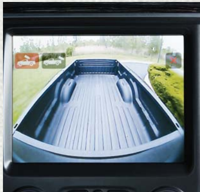
Cargo Camera Display

If snow, ice, mud or any foreign substance builds up on the camera lens, clean the lens, rinse with water and dry with a soft cloth. Do not cover the lens.