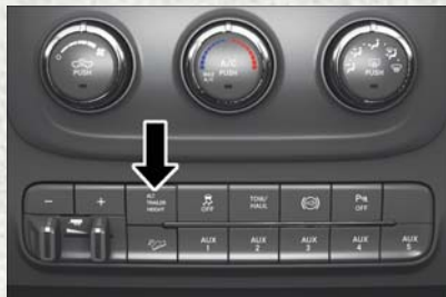
Alternate Trailer Height Button

The system requires that the ignition be in ON/RUN position or the engine running with zero vehicle speed for all user requested changes and load leveling.