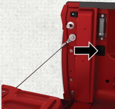
Bed Light Switch Without RamBox