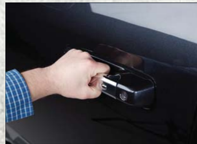
Grab The Door Handle To Unlock

With a valid Keyless Enter-N-Go key fob located outside the vehicle and within 5 ft (1.5 m) of the driver or passenger side door handle, grab either front door handle to unlock the door automatically.