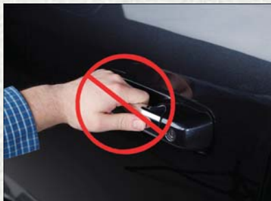
Do NOT Grab The Handle When Locking