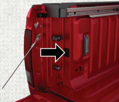
Bed Light Switch With RamBox

The cargo light and bed lights (if equipped) will also turn on for approximately 60 seconds when a key fob unlock button is pushed, as part of the Illuminated Entry feature.